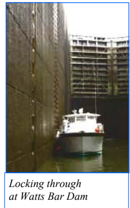
Locking through at Watts Bar Dam

Costs for individual dock slips are $30 per night, including water and power (30 and 50 amp available). Motel rooms will cost approximately $100 per night. Half the rooms are two-bedroom units, and all include a kitchenette. You can visit the marina web site at http://www.euchemarina.com/ .